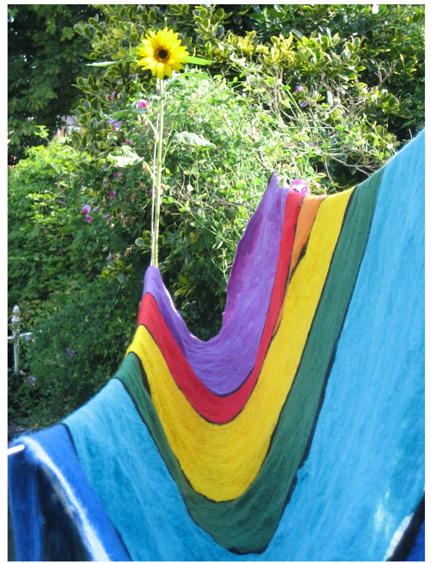
The felt drying