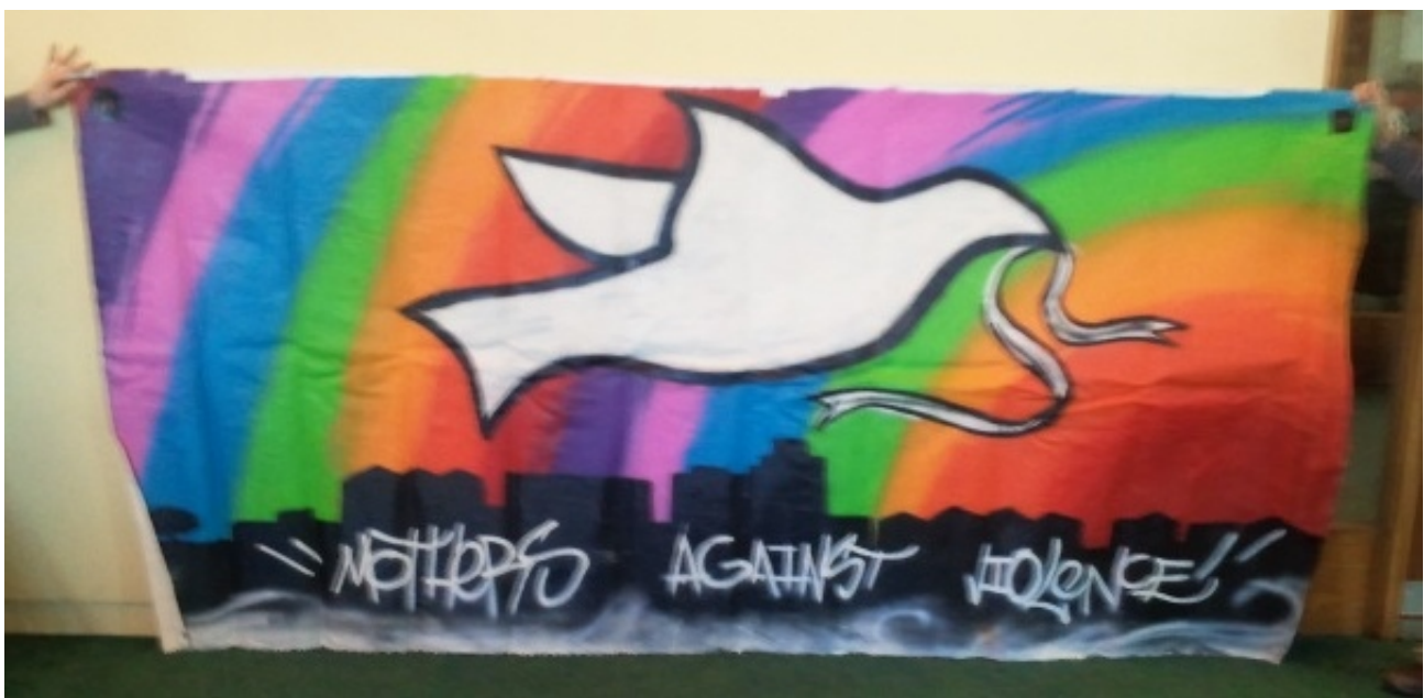
Mothers Against Violence

Posted on 4 February 2013 by All Hallows Leeds | Leave a comment