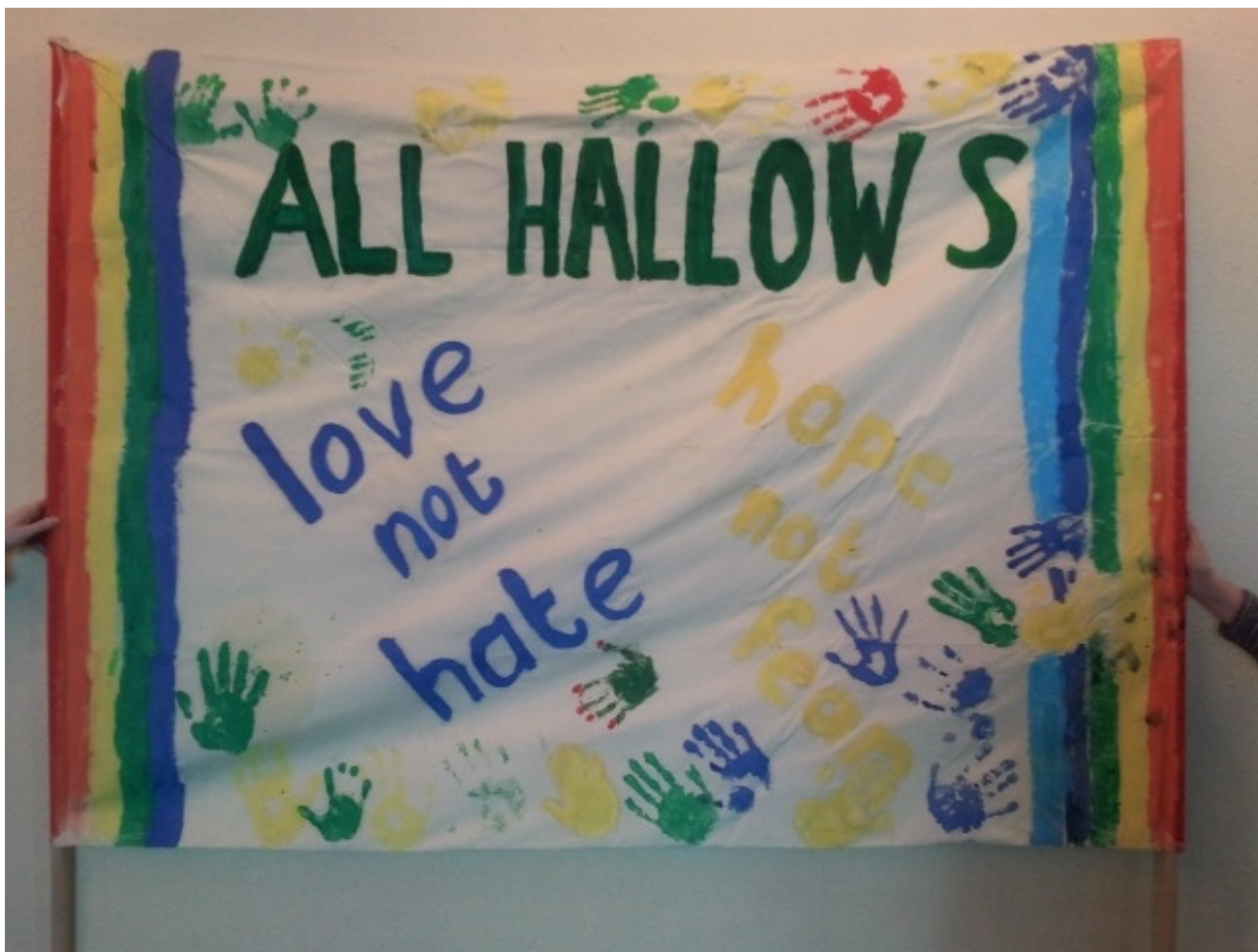
All Hallows Love not Hate Hope not Fear

Posted on 4 February 2013 by All Hallows Leeds | Leave a comment