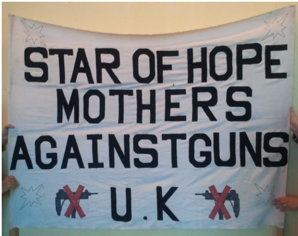
Star of Hope Mothers Against Guns UK

Posted on 4 February 2013 by All Hallows Leeds | Leave a comment