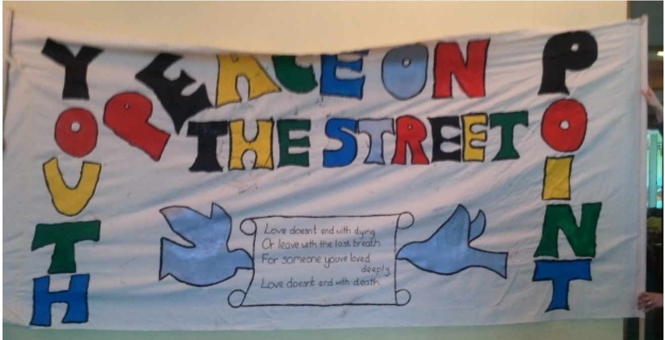
Youth Point Peace on the Street