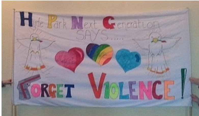
Hyde Park Next Generation Says Forget Violence

Posted on 4 February 2013 by All Hallows Leeds | Leave a comment